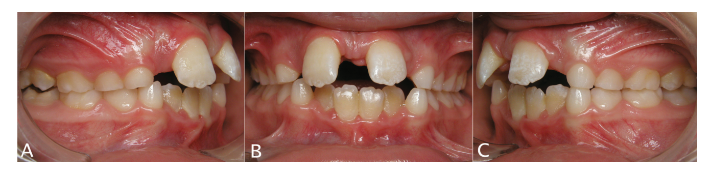
Fig. 2. Intraoral photographs taken at two-month treatment to show the initial clinical progress: A) frontal view; B) right side view; and C) left side view.

The analysis of the final photographs shows the reestablishment of normal dental development highlighting the efficiency and effectiveness of the treatment (Fig. 5). Furthermore, due to the esthetics improvement of the smile, the patient reported a higher level of self-confidence and was generally happier than in the original situation (Fig. 6).