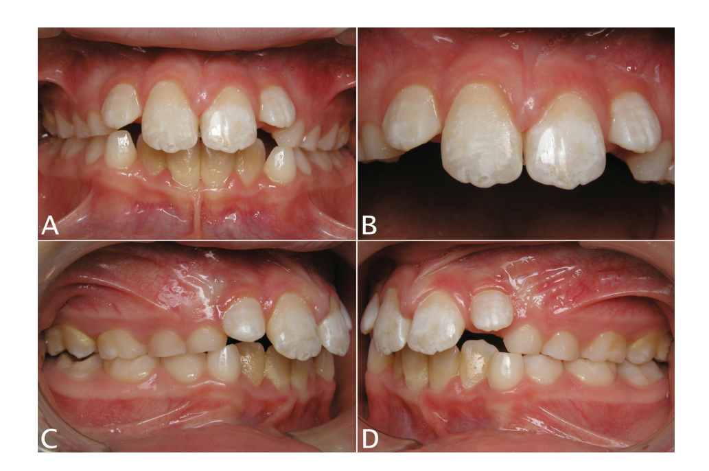
Fig. 5. Post-treatment intraoral photographs: A) frontal view; B) close-up frontal view; C) right side view; and D) left side view.