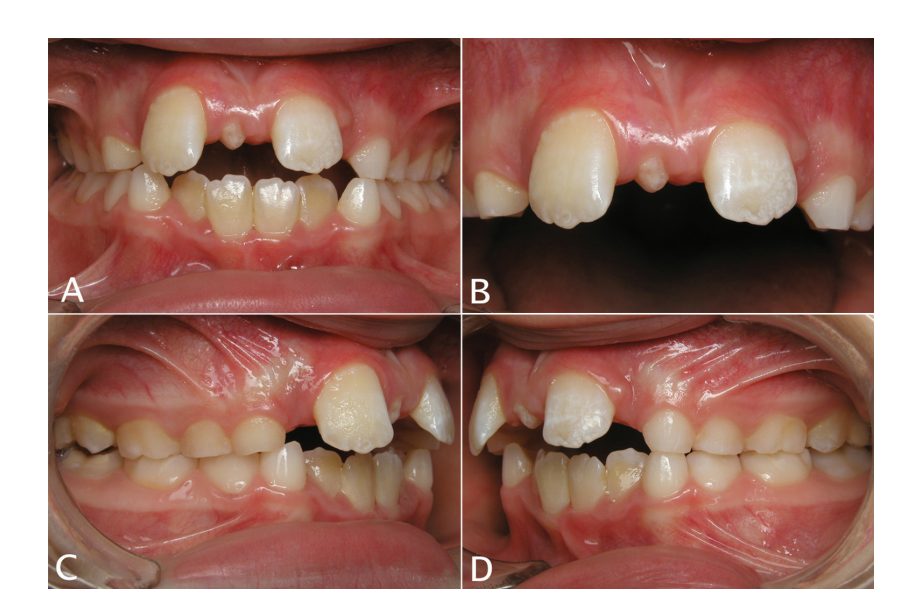
Fig. 1. Pretreatment intraoral photographs: A) frontal view; B) close-up frontal view; C) right side view; and D) left side view.

The treatment plan was designed to accomplish some clinical objectives such as the removal of the mesiodens, the discontinuation f the thumb-sucking habit to correct the open bite and the orthodontic closure of the midline diastema to allow proper eruption of the maxillary lateral incisors.