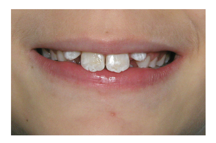
Fig. 6. Final photograph of the patient's smile.