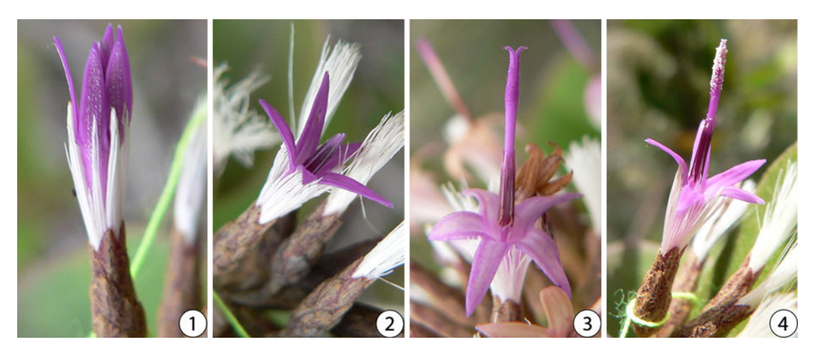
Figs. 1–4 Floral events in P. kingii. I Beginning of anthesis. 2 End of anthesis (pre-anthesis). 3 Functional male phase. 4 Functional female phase

The landscape in this region is dominated by a type of savanna known as Campos rupestres (rocky fields) located at elevations over 900 m a.s.l. Herbaceous and shrubby vegetation grows in the shallow, sandy, acid, and nutrient-